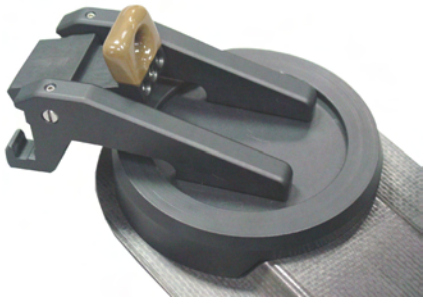
Bottom View of "Quick Release" Swivel Unit

CFI offers a wide range of Armboard pads to fit your exact needs. By utilizing high grade materials including Conductive and Pressure Relief Covers, T-Foam, Comfort Foam, Ultra Foam and Poly Foam, CFI is sure to have an Armboard Pad that provides the right combination of comfort and support.